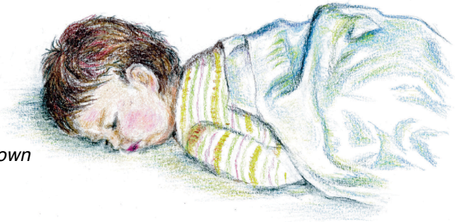
WHEN PLAYFULNESS SLEEPS

There's a room in my house where dinosaurs walk big ones and small ones that giggle and squawk Chaos reigns in that room always in uproar romping and stomping that shakes every door but when lights are turned down and playfulness sleeps my heart sees two boys that innocence keeps How can it be that those reckless in daylight now seem so fragile so gentle and slight